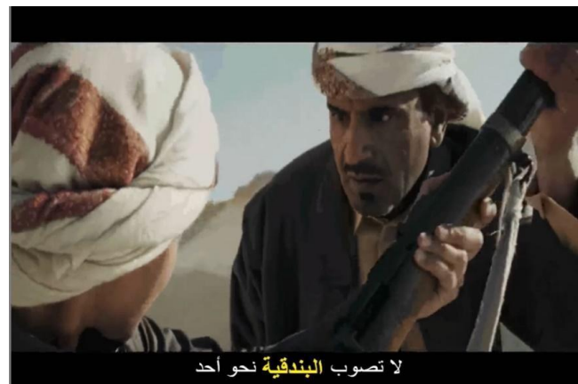
Fig. 2: Example of SDH

The second version was produced by applying local SDH parameters. Here, the chosen vocabulary was highlighted in yellow, using bigger font (see Figure 2).